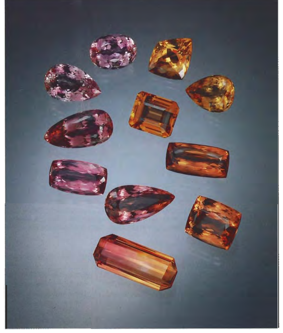
Figure 1. The fine Imperial topazes from the region near Ouro Preto, in Minas Gerais, Brazil, are most commonly intense orangy yellow to orange. The most sought-after Imperial topazes are the "sherry" red and saturated pink stones. Bi-colored stones are rare. The stones shown here range from 8.82 to 14.28 ct; the bi-colored topaz at the bottom is 14.10 ct. Stones courtesy of Amsterdam Sauer Co.

de Janeiro, traveling first by air (about 350 air kilometers) to Belo Horizonte, and then by car on Route BR040 (Belo Horizonte-Rio de Janeiro) south for 30 km (19 miles) to Route BR356, then east (toward Ouro Preto) for 53 km (33 miles), at which point a right turn onto a dirt road leads to Rodrigo Silva, about 7 km to the south. From Rodrigo Silva, a village of approximately 1,200 residents, one travels on a dirt road about 3 km west to reach the mining site. Access to the mine area is limited to those who work there or are invited by the principals. Located in one of the highest regions of the country, the Capão mine lies at an altitude of about 1,200 m (3,900 feet). The chief industry in this mountainous area is cattle ranching, both for beef and dairy products.