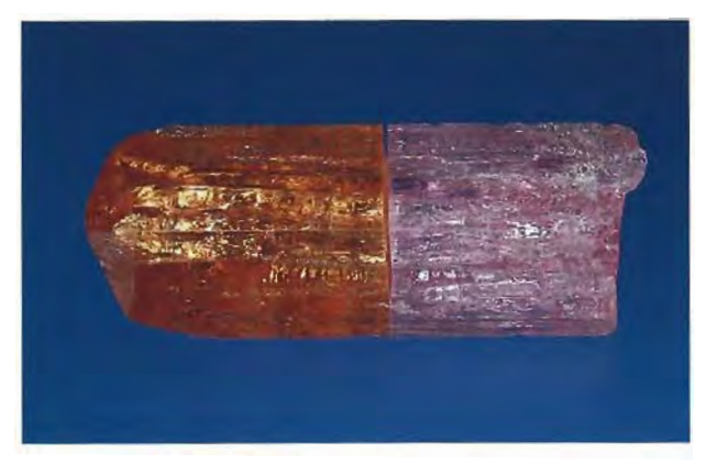
Figure 12. This 97.59 ct Imperial topaz crystal was sawn in half and the bottom was heated to 1050°F, which produced the purplish pink color.

mechanized mine currently in operation there is the Capão mine, which is near the village of Rodrigo Silva. Today, production from this mine represents as much as 50% of the total production of Imperial topaz from Ouro Preto. Although large amounts of ore are mined from the two open pits that constitute the Capão mine today, the recovery is only 0.5 ct of cut topaz per cubic meter of ore processed. Environmental responsibility and the greater depths