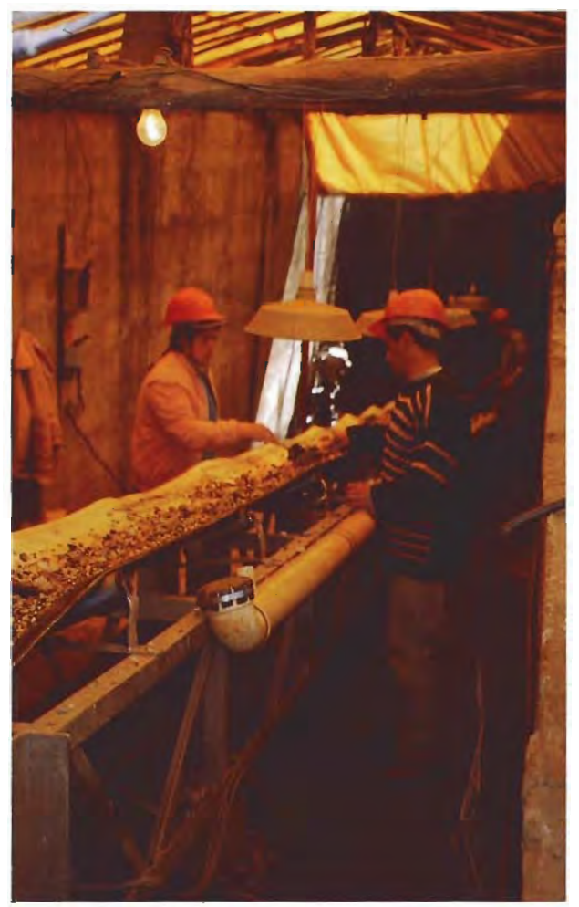
Figure 8. In a shed-like structure behind the main pit, miners manually sort through the concentrate, searching for topaz. Any topaz found is placed in tubes along either side of the conveyor belt.

Also consistent with published values are the absorption spectra and pleochroism. In most stones, the only absorption visible was a general darkening of the far red portion of the spectrum. When viewed down the c-axis, the heated pink stones and the pinkish purple crystals showed a barely discernible line at 682 nm. This line is related to the chromium that produces these colors; it has previously been