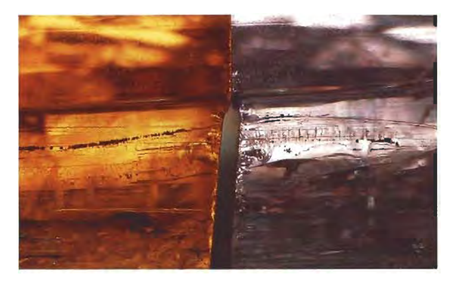
Figure 15. No difference was observed in the nature of the inclusions between the heated and unheated halves of the sawn crystal. Note the undisturbed liquid inclusion plane in the center of the photograph, where it crosses the saw cut. magnified 20×.

investigation to determine its usefulness as an identification criterion.