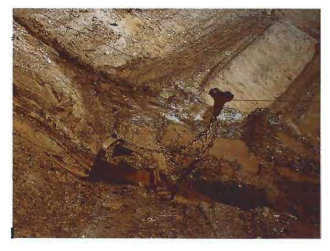
Figure 5. One of two dragscrapers in the larger pit at Capão pulls the saturated, intensely weathered host material to the top for processing.

Although "peach" to pink (figure 11) Imperial topaz does occur naturally, these colors may be produced in some brownish yellow or orange topaz by heat treatment, which removes the yellow color center. At one operation visited by the second author (ASK), the cut stones are put in a small (about 7.5 cm square) clay tray that is then placed in an oven, and the temperature is brought to 1050°F (565°C; it takes approximately 40 minutes). The oven is then turned off, and the stones are allowed to cool slowly to room temperature, to avoid thermal shock, before they are removed. Although the occasional "peach" stone that results from a partial heating may turn pink on further heating, the pink color obtained at 1050°F is usually the best that can be achieved. Reheating a pink stone or heating it