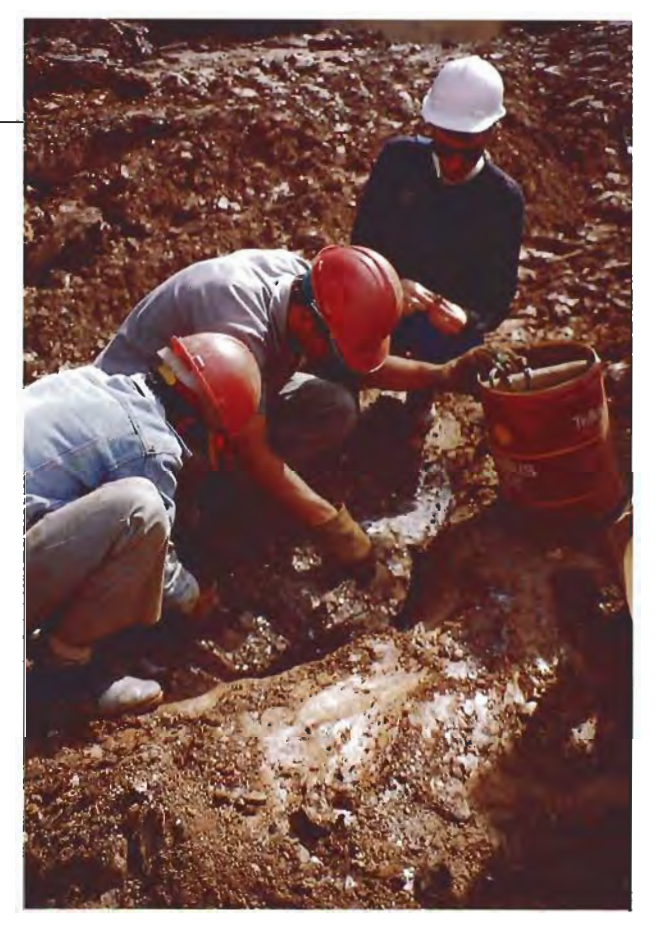
Figure 6. When the bulldozer uncovers a distinctive kaolinite vein, all other activity stops. Certain miners (denoted by red hats) then search for topaz crystals by hand. Here, the senior author examines a topaz crystal found in this thin white vein.

longer will not produce any additional change (see also Nassau, 1994). However, as shown in figure 12, the change is often substantial.