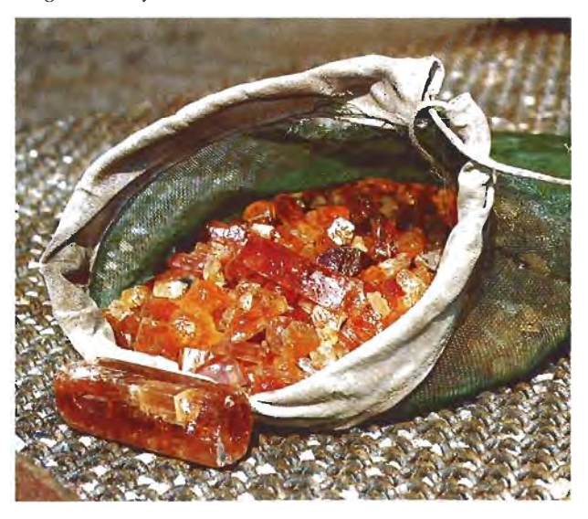
Figure 10. For the authors, the mine owners removed the topaz crystals recovered after only about a half-day's work (usually, they are recovered only once a day). The 3.5–4 kg of topaz crystals shown here represent a particularly good yield for a single day from the larger pit. The largest crystal, in the foreground, is approximately 8 cm long.

Amsterdam Sauer, topaz cutters use a 360 grit grinding wheel, a 600 grit faceting disk, and polish the stones on a lead/tin lap with Linde A (Al_2O_3) powder. Recovery depends on the amount of inclu-