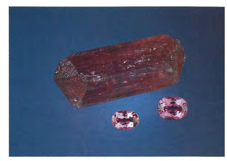
Figure 9. One of the rarest colors of topaz from the Ouro Preto region are these pinkish purple gems, found in a small area of the Capão mine. This crystal is 36.87 ct; the cut stones are 1.19 and 0.65 ct.

Because topaz has perfect basal cleavage, the table must always be polished at an angle to the c-axis (12°-15°, according to Webster, 1994); extreme care should be taken to avoid grinding the stone perpendicular to the cleavage plane. Also, inclusions can cause the stone to break on the wheel. At