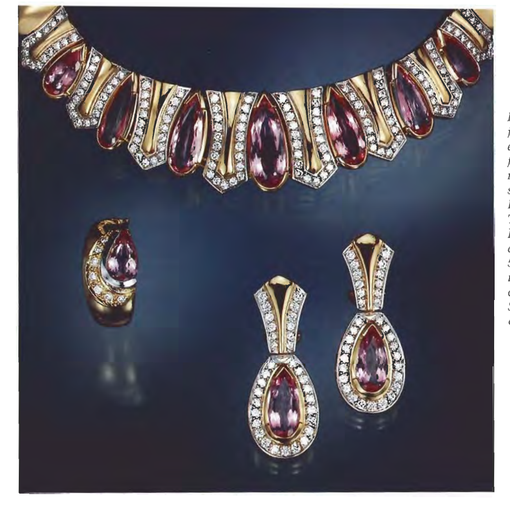
Figure 11. This suite of jewelry is composed entirely of pink topazes from Ouro Preto. They represent some of the superb stones from this historic Imperial topaz locality. The topazes in the necklace weigh a total of 30.36 ct; those in the earrings, 5.50 ct; and the one in the ring is 1.90 ct. Jewelry courtesy of Amsterdam Sauer Co.; photo © Harold e) Erica Van Pelt.

sions in each crystal. Well-formed, fairly clean crystals yield up to 2 carats per gram.