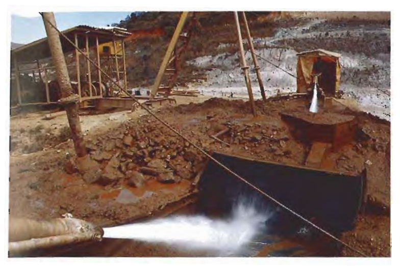
Figure 7. The two dragscrapers bring the host material directly to corresponding platforms at the top of the larger pit, where miners wield large water cannons to wash off the finer particles and push the rock fragments through a series of grates. The largest rocks are screened out first.

stones that had been heat treated to purplish pink (0.90–2.61 ct); and one yellowish orange crystal (97.59 ct) that had been sawn in half, with one half then heat treated to purplish pink. All of the heat-treated stones had been treated by the method described in the preceding section.