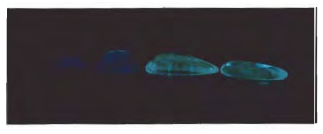
Figure 13. A difference in short-wave UV fluorescence was noted between the unheated and heattreated faceted topazes examined for this study: here, a weak chalky yellow-green in the two unheated pinkish purple stones (left), as compared to moderate to strong greenish-to-yellowish white in the heat-treated pink stones (right).

mechanized mine currently in operation there is the Capão mine, which is near the village of Rodrigo Silva. Today, production from this mine represents as much as 50% of the total production of Imperial topaz from Ouro Preto. Although large amounts of ore are mined from the two open pits that constitute the Capão mine today, the recovery is only 0.5 ct of cut topaz per cubic meter of ore processed. Environmental responsibility and the greater depths