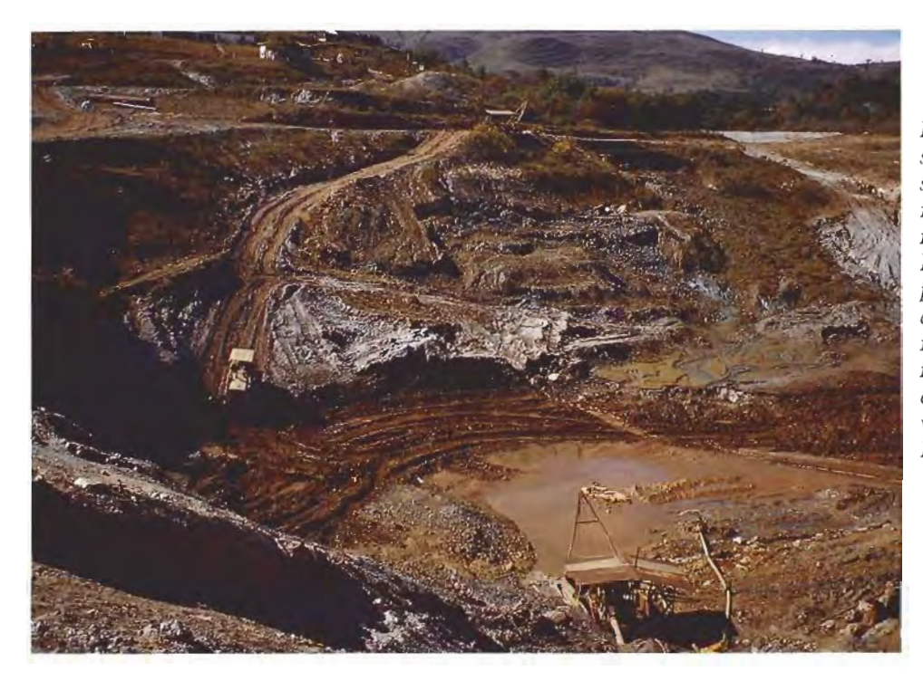
Figure 4. The newer, shallower pit at Capão separated from the original pit by only a narrow access road (on the left)—has proved very productive. Here, a bulldozer pushes the intensely weathered rocks and soils into the center of the pit for washing.

For final processing, crystals and rock fragments from one of the silos are placed on another conveyor belt, where several sorters pick out the topaz by hand (figure 8). By only processing one of the two sizes at a time, the miners reduce the risk of larger stones hiding smaller ones. Any topaz found is placed in a tube that runs alongside the conveyor belt. At the end of the day, a security manager runs water through the tube and collects all of the topaz in a bag at one end. These crystals are then placed in a locked box that has a padlock at the bottom and two "blades" at the top, so the crystals can be inserted easily but will not drop out if the box is turned upside down